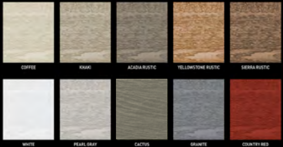
For the most accurate color representation use official KWP color chips.

Eco-side® nature-inspired palette will bring life to any home.